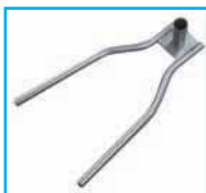
Drive-on Car Foot