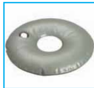
Base Foot and Weighting Ring